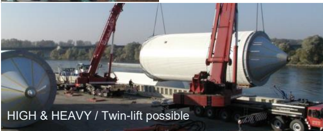
HIGH & HEAVY / Twin-lift possible