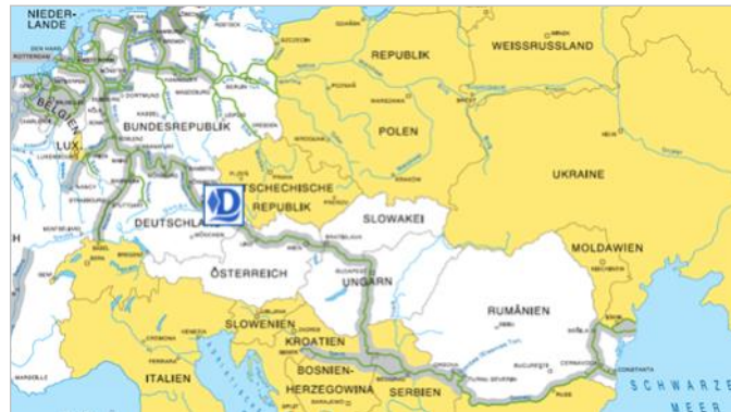
Donau-km 2282,374 – 2283,700 links